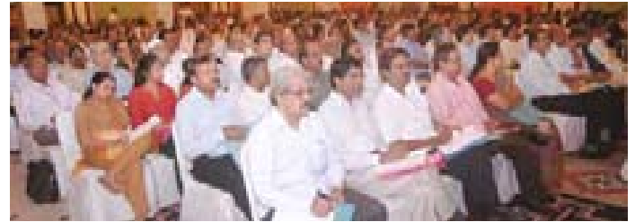
Cross section of delegates at DTC Workshop at Hotel Savera