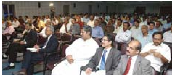
Cross section of delegates at Seminar on International Taxation