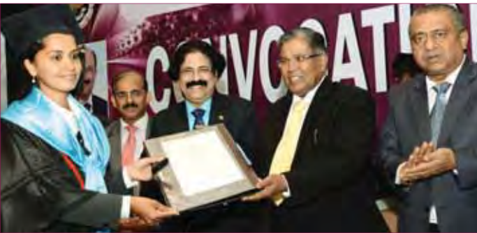
Convocation - June 19, 2015, Chennai: CA. K. Rahman Khan, MP, Former Union Minister of Minority Affairs presenting the rank holder certificates.