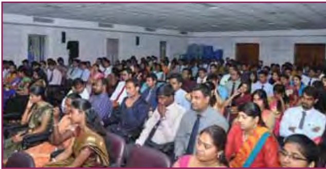
GMCS Valedictory function - June 3, 2015, Chennai: Cross Section of CA Students

SIRC congratulates him on his election and wish him all success in his endeavour.