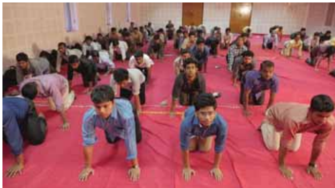
Photograph taken on the occasion of celebration of International Yoga Day at ICAI Bhawan Chennai on June 21, 2015