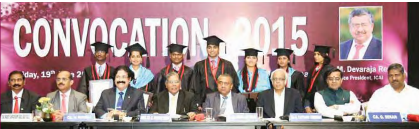
Convocation - June 19, 2015, Chennai: Group Photo of the Rank Holders from Southern Region at the Convocation with the dignitaries on the dais.