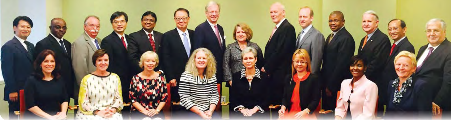
IFAC Board Members

Southern India Regional Council ▶ THE INSTITUTE OF CHARTERED ACCOUNTANTS OF INDIA ▶ SET UP BY AN ACT OF PARLIAMENT