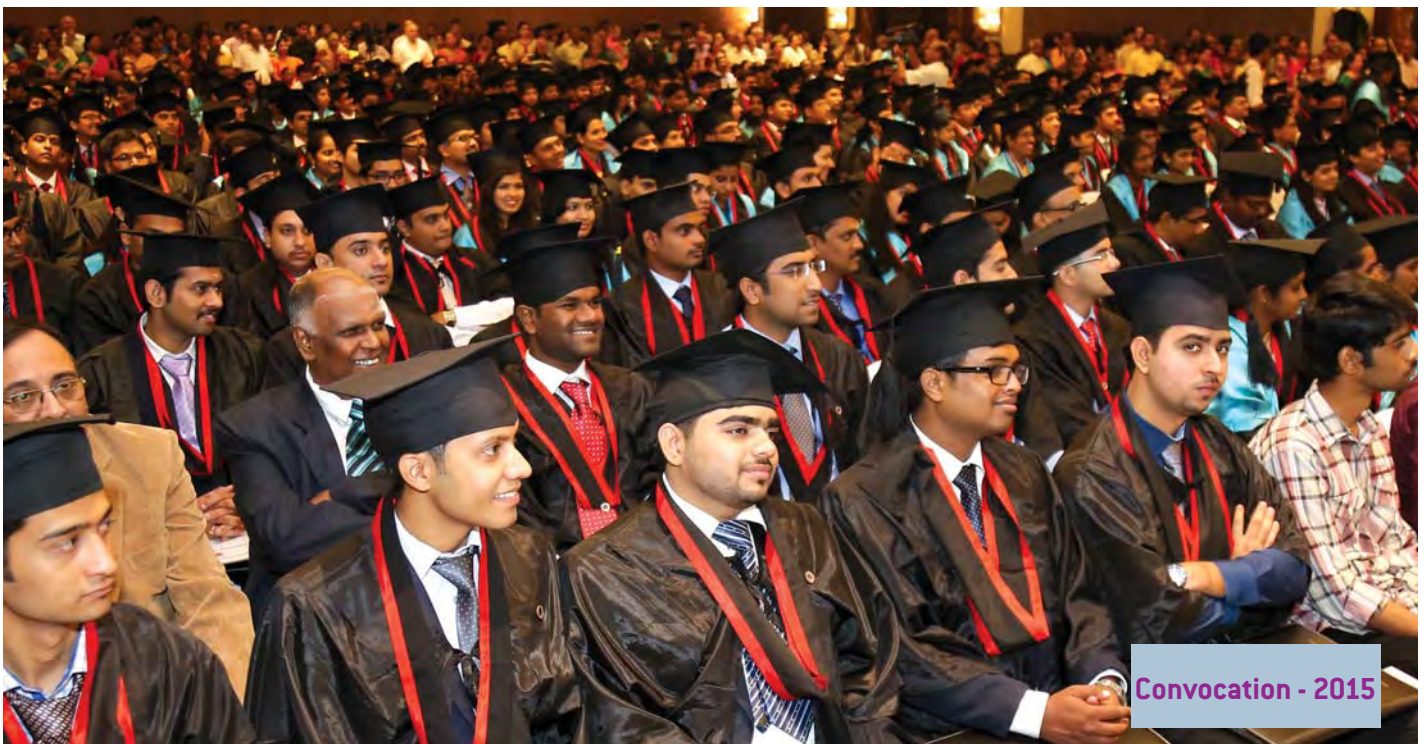
Convocation - 2015