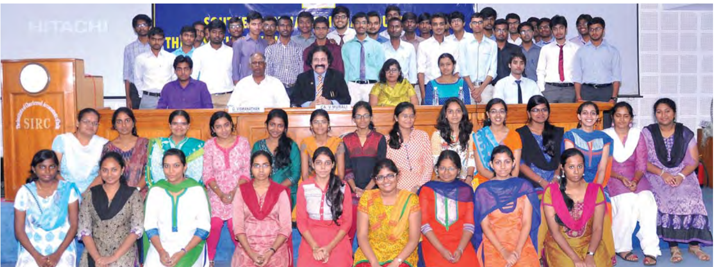
Inauguration of GMCS Batches on October 29, 2015: Group photograph.