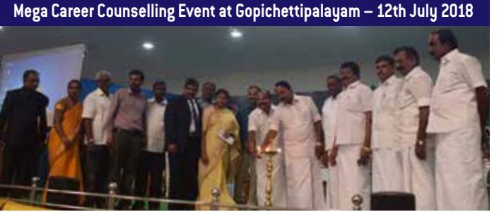
As per ICAI's MOU with Govt. of Tamilnadu School Education Dept. to popularize CA course among school students, a mega career counseling event at Gopichettipalayam was organised by Erode Branch of SIRC. Hon'ble Thiru K.A.Sengottiyan, Minister for School Education, Govt. of Tamil Nadu inaugurates the event along with other dignitaries.