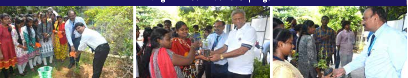
Planting of saplings in the institute premises and distribution of saplings to Members, Students and others as part of Go Green Mission.