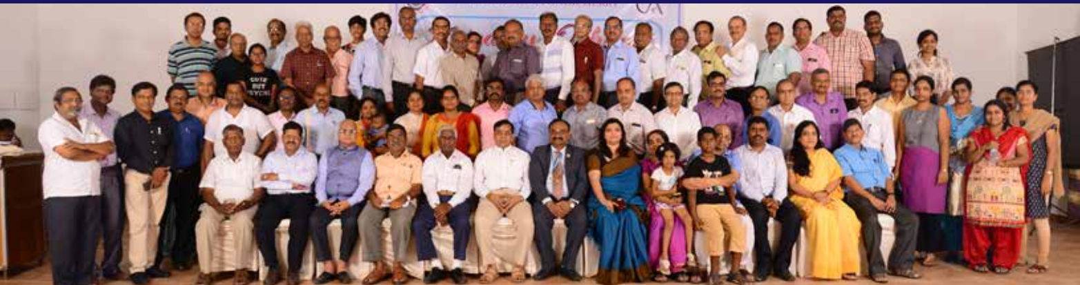
Group Photograph of Speakers, Delegates, Family Members with Chairman SIRC, Central Council Member and Managing Committee Members of Vellore, Pondicherry and Kanchipuram District Branches of SIRC during the Regional Residential Seminar held at Pondicherry on May 29 and 30, 2018 organised by SIRC of ICAI, jointly hosted by Vellore, Pondicherry and Kanchipuram District Branches of SIRC of ICAI.