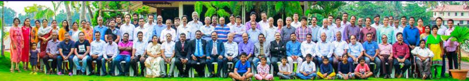
Group Photograph of Speakers, Delegates, Family Members with Chairman SIRC and Managing Committee Members of Alleppey Branch of SIRC during the Regional Refresher Course held at Alleppey, organised by Professional Development Committee of ICAI.