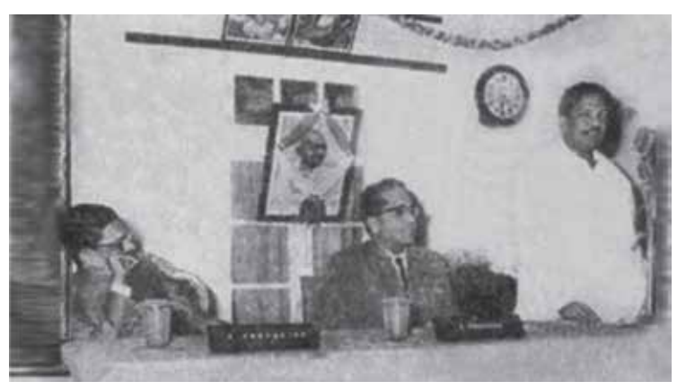
Late Shri M. Karunanidhi, then Chief Minister of Tamil Nadu addressing the members on the occasion of Centenary Celebrations of Mahatma Gandhi on 7th November 1969 at SIRC Premises.

Whilst on the subject, SIRC is privileged to share that it had celebrated the Birth Centenary of Mahatma Gandhi on 7th November 1969. Hon'ble Thiru M. Karunanidhi, Chief Minister of Tamil Nadu was the Chief Guest on the occasion. Hon'ble Justice Mr. G. Ramanujam, Judge, Madras High Court also addressed the gathering. It is very gratifying to share that the celebration was organized at our Institute Premises in the First Floor and this is the only occasion where a Chief Minister of a State visited SIRC Premises. A file photograph of the function is published herewith for your reference.