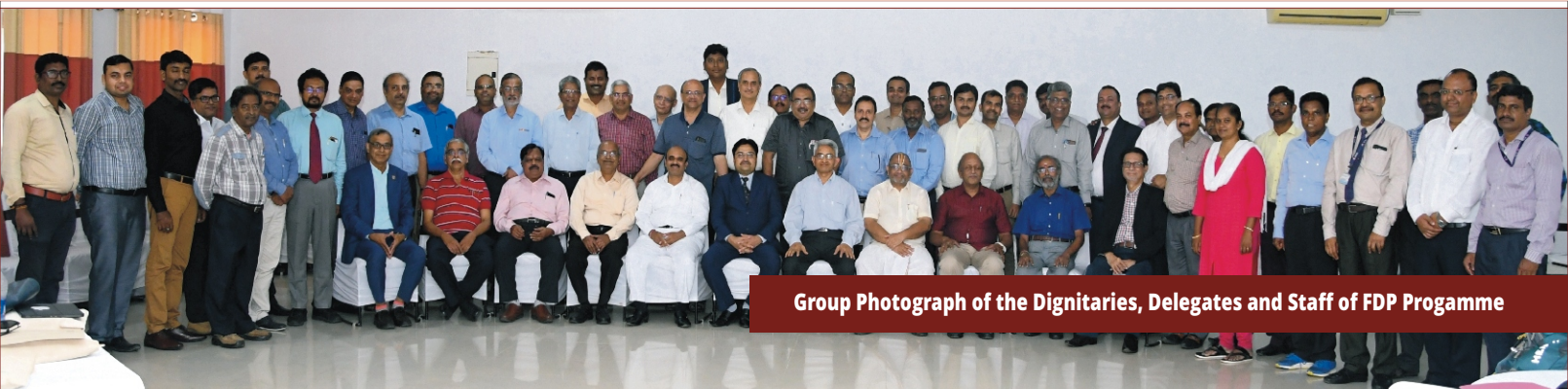
Group Photograph of the Dignitaries, Delegates and Staff of FDP Programme