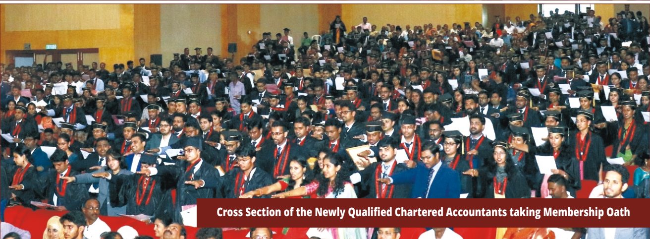
Cross Section of the Newly Qualified Chartered Accountants taking Membership Oath