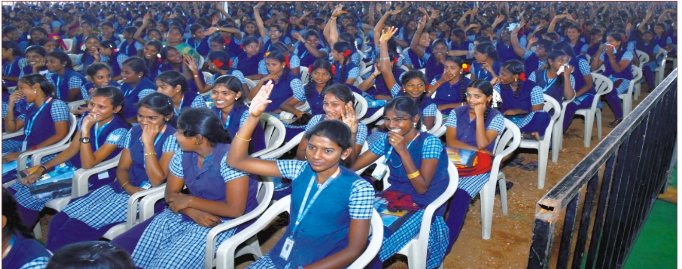
More than 7000 Government School Students Participated